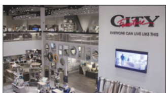
KEITH KOENIG VIDEO: City Furniture Retail Store