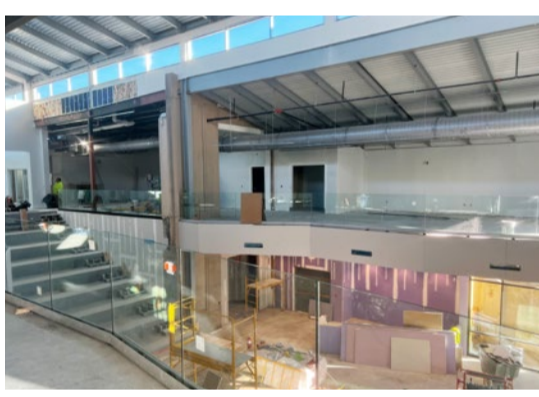
Celebration Hall from the North Exhibit Hall Balcony