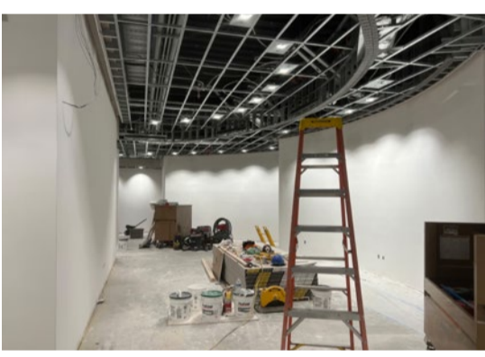
Hall of Fame