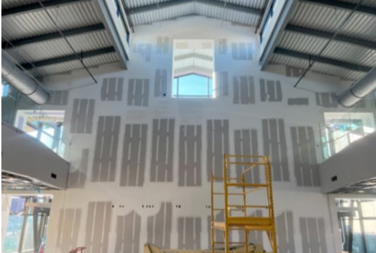
Celebration Hall and the Dynamic Story Wall